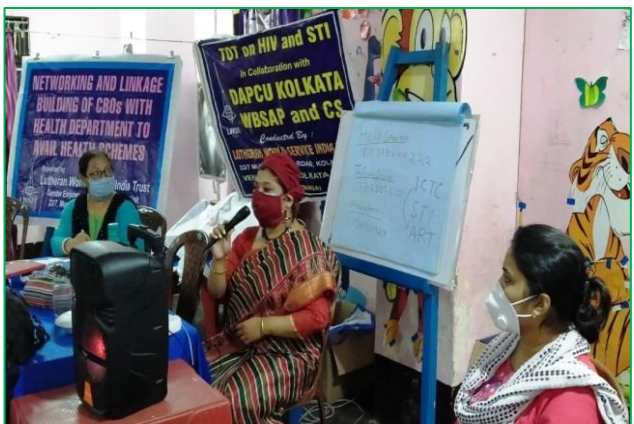
For Internal Circulation Only