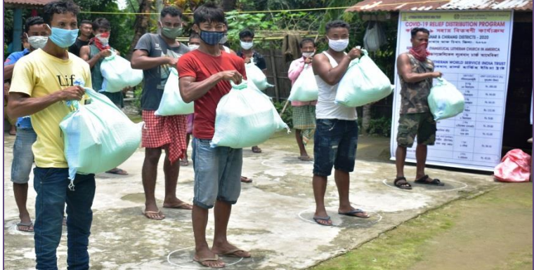
For Internal Circulation Only